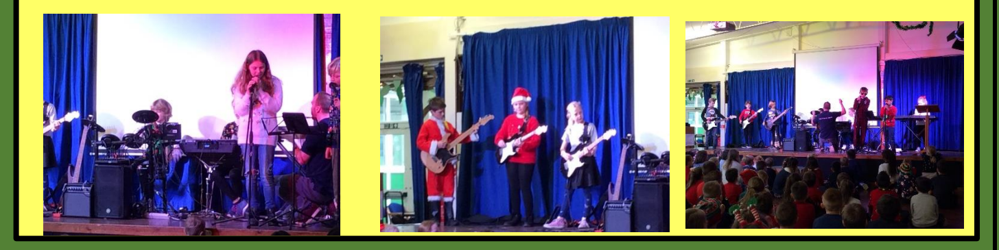
Cinderella and Rockafella!

Our Rock Steady bands lifted the roof on Friday with some great tunes! Forming a band is no easy feat – there are lots of factors to contend with including playing in time; keeping to the beat and following the melody. We definitely have future rock stars here at Fair Field!